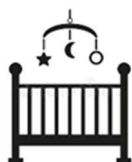
Baby bed and chair